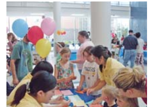
NDI booth at Literacy Festival

Various businesses and organizations had booths at the library on festival day. The NDI booth introduced Japanese culture by writing children's names in Japanese and Chinese characters and teaching them origami.