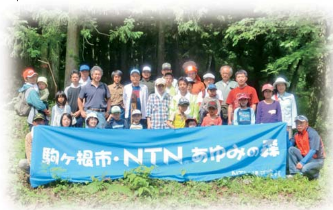
“NTN Kigyo no mori” of Nagano Works

The Group considers it necessary to undertake ongoing activities to protect and foster forests around Japan, and plans to expand these efforts.