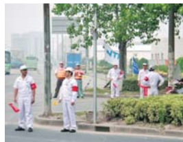
Shanghai NTN Corporation traffic safety patrols

In fiscal 2009, six business sites in Japan and abroad participated in traffic safety patrols.