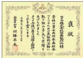
Certificate of merit

In July 2009, Shizuoka Prefecture awarded the Iwata Works a Prefectural Governor's Merit Award for Activities to Help Create a Gender-Equal Society. This program recognizes businesses within the prefecture that are striving to contribute to gender-equality. Iwata Works was lauded for establishing "Bear Kids Land," an in-house nursery, for promoting work-life balance, and for other initiatives to enable women to demonstrate their abilities and become more active in the workplace.