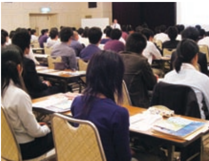
A talk on compliance issues during a training session for new employees

In fiscal 2008, we held meetings to explain the “CSR Guidebook” to CSR managers and to all managers to educate them on issues related to legal and regulatory compliance. We