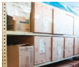
Supplies at Okayama Works in preparation for the new strain of influenza