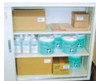
Supplies at Nagano Works in preparation for the new strain of influenza