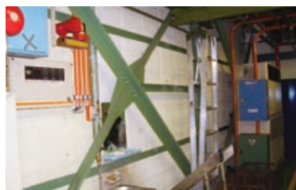
Earthquake resistance improvements at Iwata Works

We have a system that can be used to confirm the personal safety of employees through the internet or telephone in the event of a disaster, and in fiscal 2008, this system was expanded to cover our primary group companies. Every year, we simulate a disaster and carry out training on how to use the system.