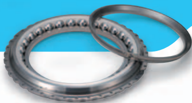
Outer diameter*: 52.5 cm